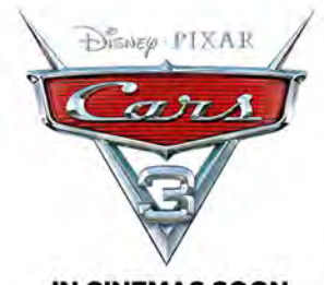
IN CINEMAS SOON