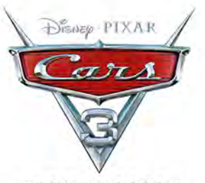
IN CINEMAS SOON