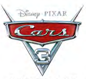
IN CINEMAS SOON