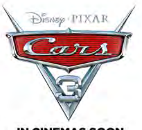
IN CINEMAS SOON